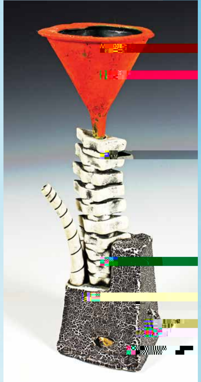
BLUE BOY TPOT