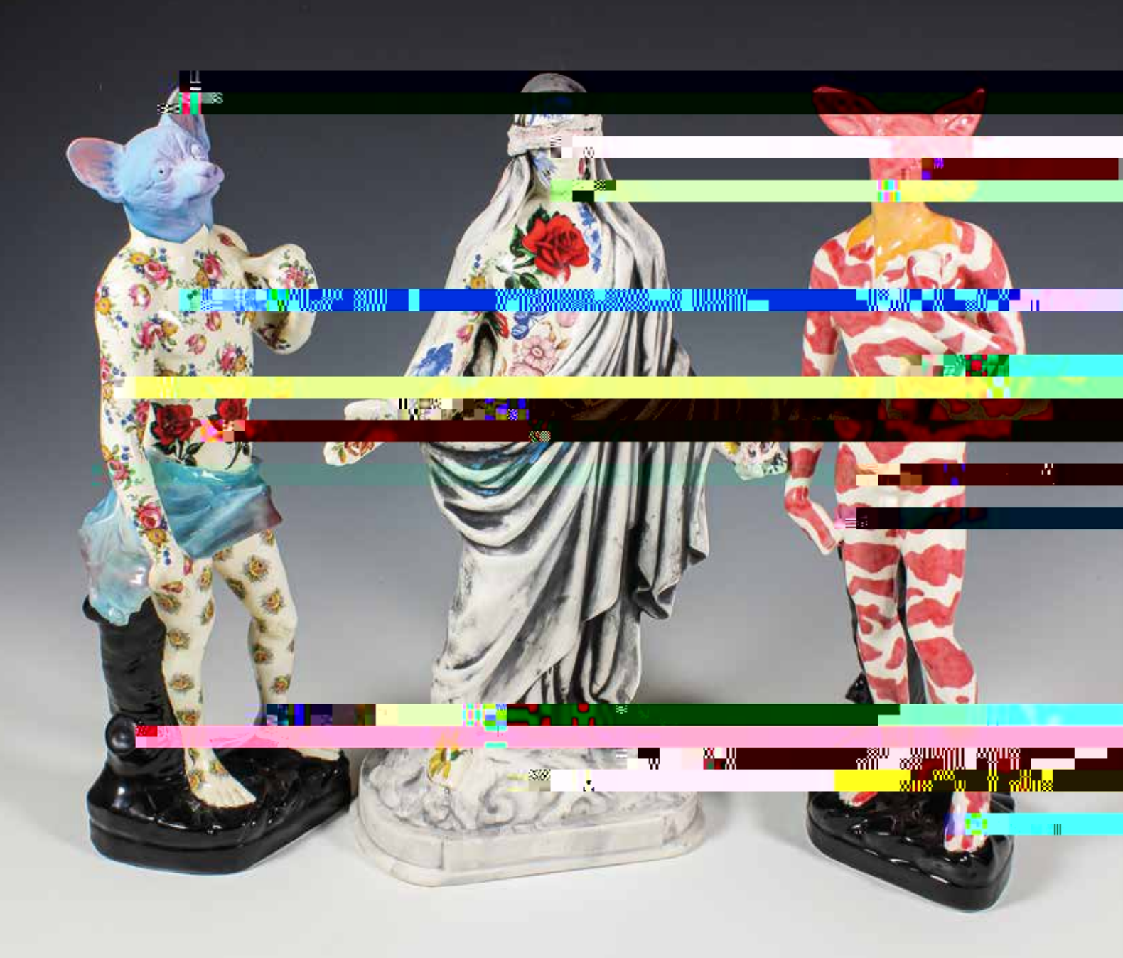
February 14 - March 25, 2022